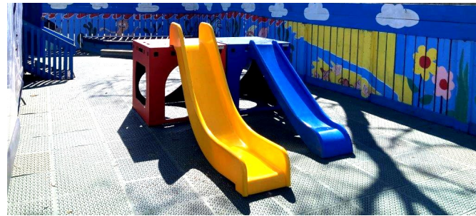
Safe fully fenced outdoor area with toys, including large sandpit