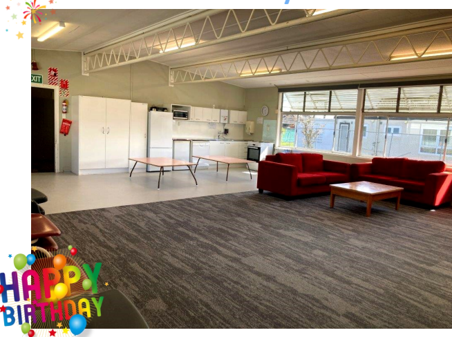
Maximum 50 people I 50 Chairs I I 0 Tables Kitchen facilities I Children's tables and chairs I White Board Blinds I Heat Pump I Overhead decoration Perfect space for parties, opens onto covered fenced deck & outside

play area with large sandpit and plenty of toys