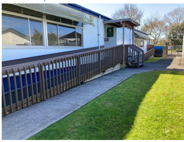
Push chair and Wheel chair access. Some grassed space available for BBQ's & small bouncy castles