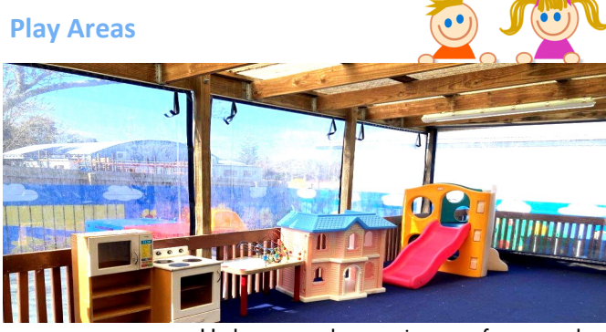
Under cover play area in case of wet weather

play area with large sandpit and plenty of toys